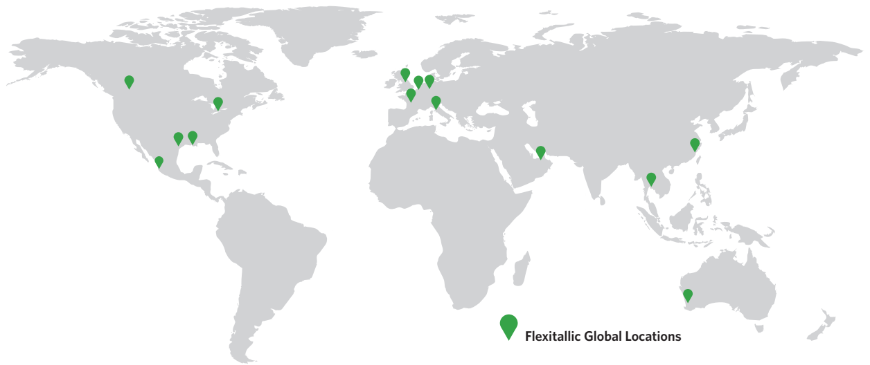
Flexitallic Global Locations